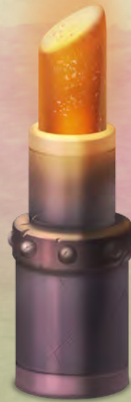
LIPSTICK OF FLAMES