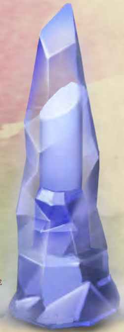
LIPSTICK OF ICE