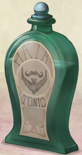
HAIR GROWTH TONIC

pocket dimension size is 3 cubic feet and can hold up to 20 pounds. Pulling an object out takes a bonus action and the wearer has to have seen the object before. If the wig is removed, all items that were placed inside fall out.