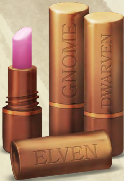
LIPSTICK OF LANGUAGES