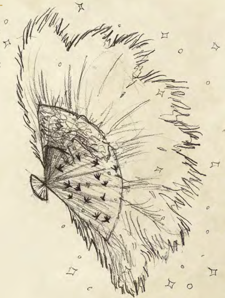
FAN OF FLOURISHING

Demanding Flourish: Affected creatures are compelled to fling whatever spare change they have toward the user.