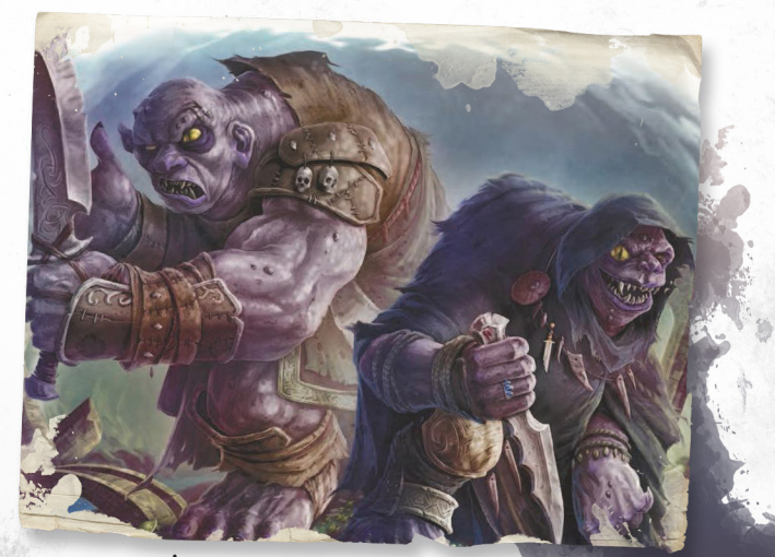
LARG AND MUG 1431 DR

Warleader. The giant commands up to three allied creatures within 60 feet of it that can hear the giant to use their reaction and move up to 30 feet toward a hostile creature.