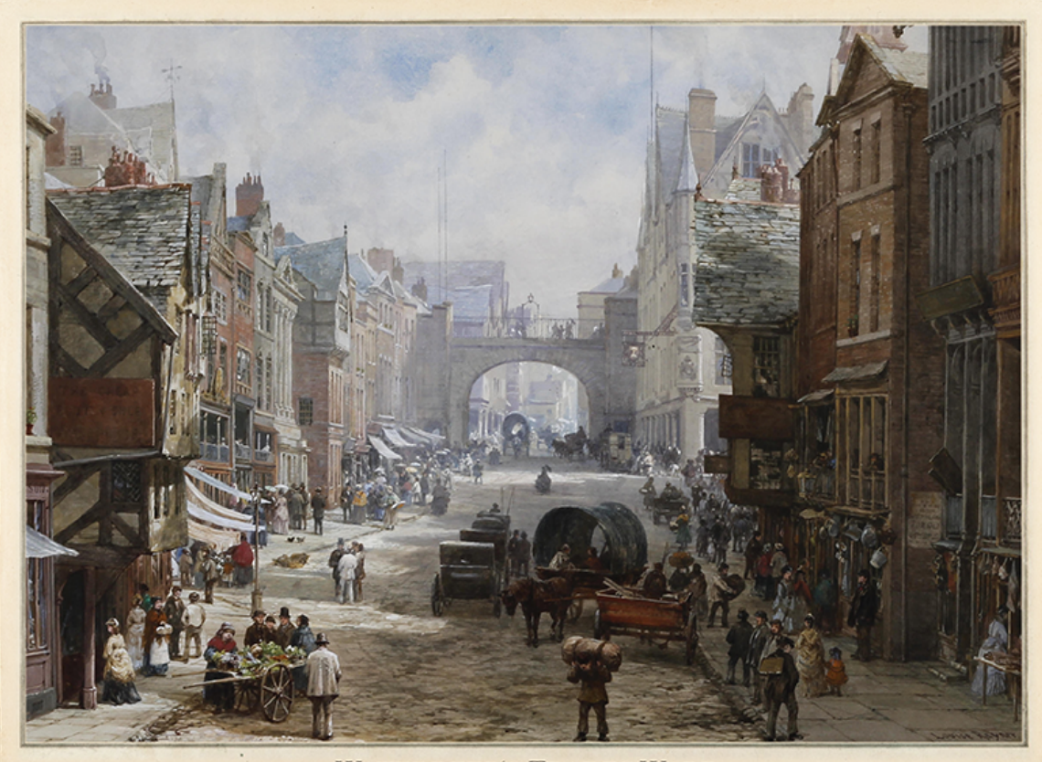
WATERDEEP'S TRADES WARD

Killian (LN male human guard MM 347) is an honest and concerned citizen, who is planning an unauthorized sting operation on a drug den called Dankmire in the South Ward. He has assembled a handful of reliable fighters who will support him. The Dankmire is a true hornets' nest. 20 drugged bandits (MM 343) hide in secret rooms beneath the Dankmire and defend the joint to the last man. After the dust has settled, the city guard appears and attempts to arrest the remaining combatants. The characters can prevent an arrest by succeeding on a DC 15 Charisma ( Persuasion ) check.