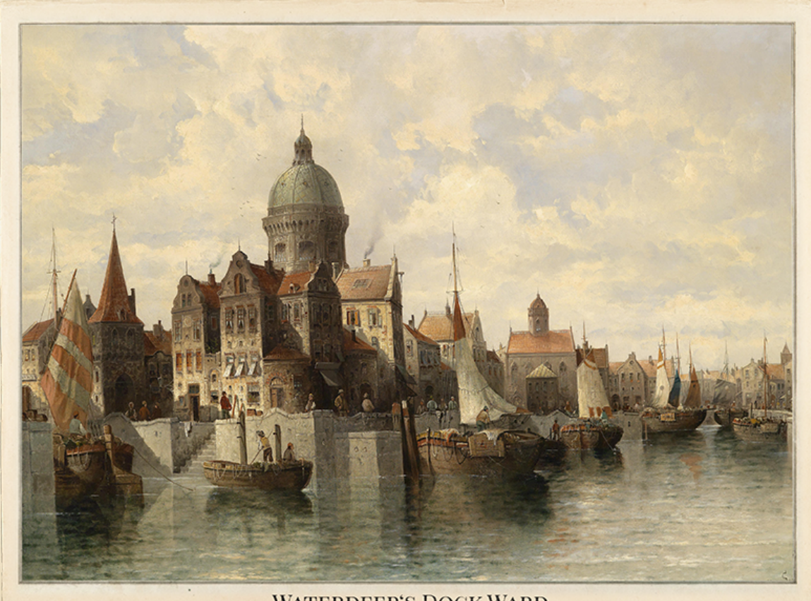
WATERDEEP'S DOCK WARD

There is great cause for concern. The relationship between Waterdeep and Luskan is at an all-time low, and this incident could lead to a full-scale war. Currently, the Waterdhavian diplomats are working tirelessly to pacify their Luskar counterparts. Captain Kolden is sure that the flag was stolen by an enemy agent to justify a war. In reality, a pair of drunk students stole the flag, which now flies in the students' humble abode in the South Ward. One of the students, named Icarium (CN male half-elf apprentice wizard VGTM 209), stole a potion of flying from a tutor's office and used it to swipe the flag directly from the pole. An old man who needed to relieve himself saw the flying student in his school uniform of the Watchful Order of Magists and Protectors, but nobody believes him since he is senile.