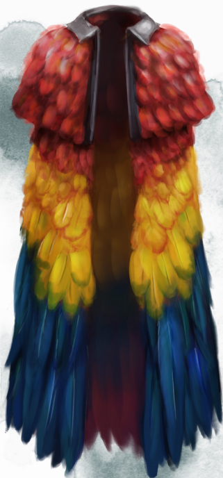
CLOAK OF THE SCARLET MACAW