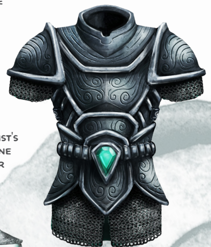
ARMOR OF THE MENDER