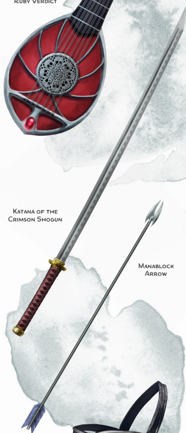
KATANA OF THE CRIMSON SHOGUN