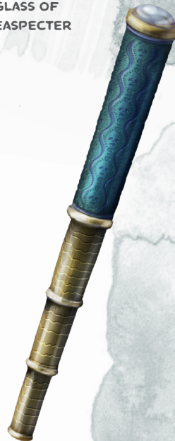
SPYGLASS OF THE SEASPECTER