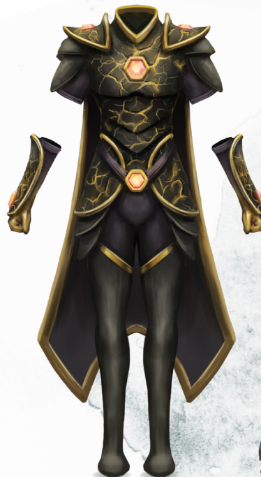
SUIT OF THE GOLDEN SHADOW