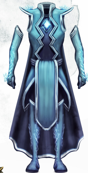
SUIT OF THE ETERNAL STORM