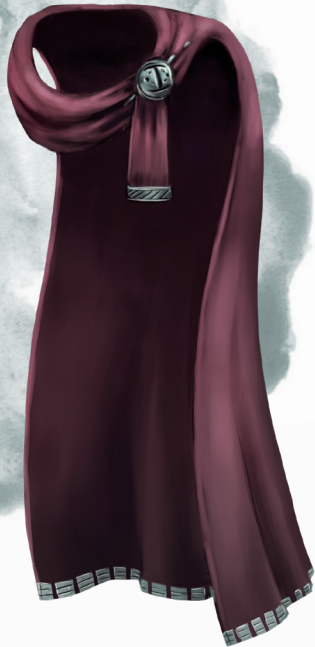
CLOAK OF SOLITUDE