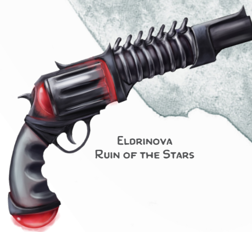
ELDRINOVA RUIN OF THE STARS