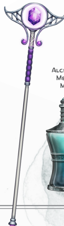
ASTRALIS THE EYE OF THE UNIVERSE