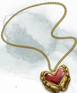
AMULET OF THE INDISPENSABLE