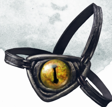
KRAKEN SEER'S EYEPATCH