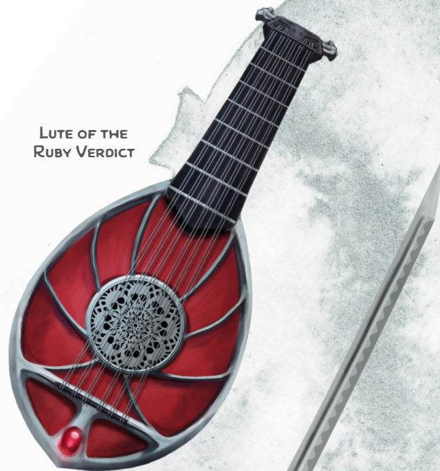
LUTE OF THE RUBY VERDICT

Arcane Dissonance. When a creature is hit by this arrow they have to make a Constitution saving throw (DC 13 + your proficiency modifier). On a failed save they take an extra 1d8 Force damage and lose concentration on any spells they are casting. If the target failed the save by 5 or more they are also unable to cast spells until the end of their next turn.