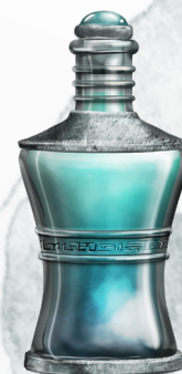
ALCHEMIST'S MEDICINE MAKER