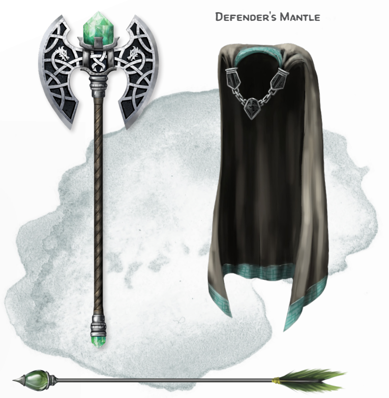
DISTILLED ACID ARROW