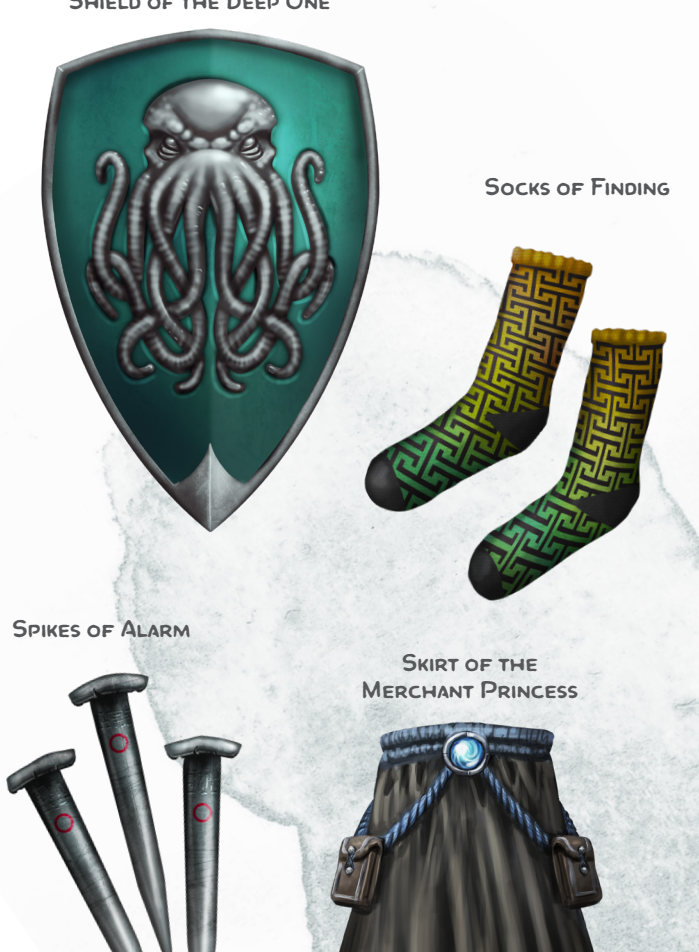
SHIELD OF THE DEEP ONE

Boundary of Spikes. You can place multiple spikes in a 200ft. radius, meaning each spike has to be within a 200ft. range of all the other spikes. You can speak a command word to link them together. Whenever a creature crosses the perimeter line between two spikes the alarm is triggered.