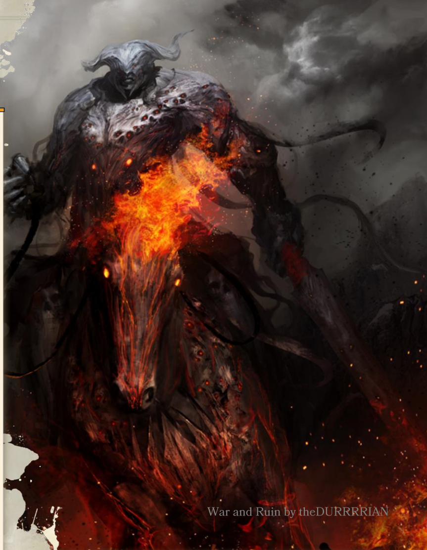
War and Ruin by theDURRRRIAN

Tide Of Chaos (Costs 2 Actions). War uses his power over chaos to turn allies against each other. One target within 30 feet must make a DC 18 Wisdom saving throw. On a failed save, the target is charmed for 1 minute or until its hit points are reduced to 0. While the target is charmed by War, it must attack its closest ally.