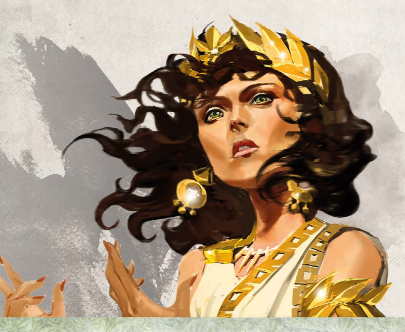
My sister Vallus: wisest of the gods, queen of the fun-haters. - Kyrah, Poet Laureate

Vallus is revered as the goddess of wisdom and beauty, and she is believed to know as much about Thylea's history as Sydon and Lutheria. She was once known to travel far and wide, surveying ancient ruins and collecting lore concerning the origins of the land and the fey races. Prayers are offered to Vallus when guidance is needed and information is scarce. She is the oldest