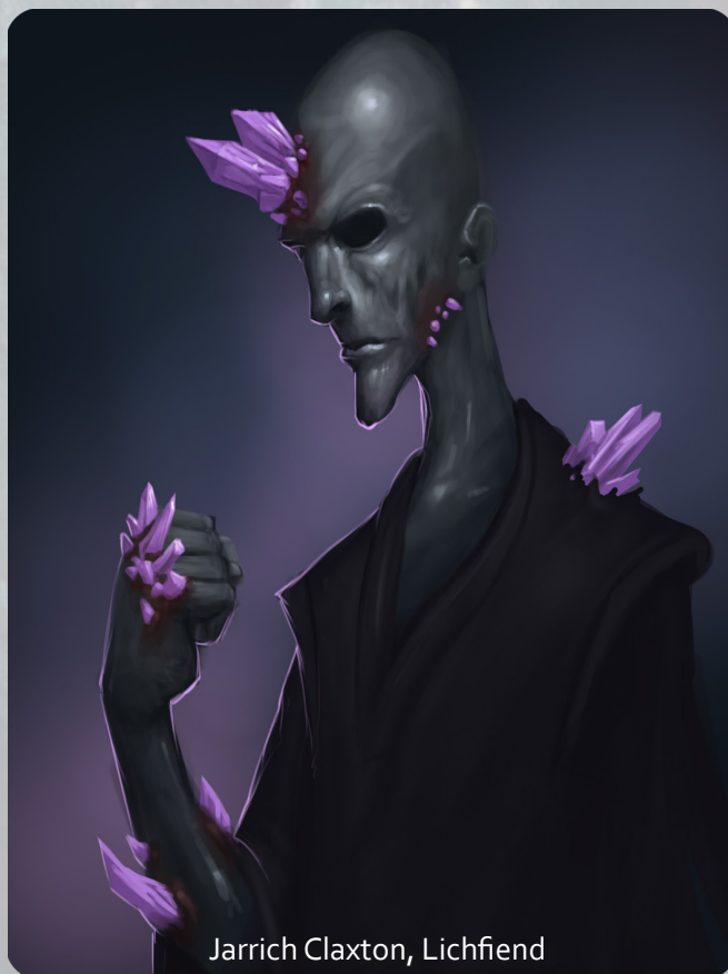
Jarrich Claxton, Lichfiend

The room before you is almost incomprehensible in its construction. The floor is a sheet of thin crystal, with a lake of boiling tar churning beneath it. Seated upon a makeshift throne is a gaunt, haggard man with crystals protruding from his body. In the center of all of this, a foreign-looking skull levitates slowly.