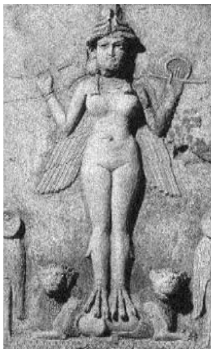
A relief of the goddess Inanna.

The Sumerian gods were very human in their behavior, falling in love, giving birth to children, fighting, arguing, and murdering each other. Despite their human foibles, the gods were considered immortal and all-powerful. Humans were nothing more than servants of the gods and lived at their whim. To keep the gods happy, the people built huge, pyramid-shaped temples (ziggurats) in each city-state. Here they would offer various sacrifices to appease these fickle beings.