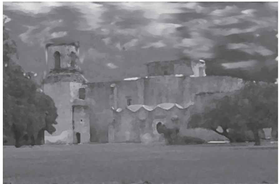
Painting of present-day La Bonita, as a state park and museum.

In the 1770's, the Spanish authorities built Fort Flores approximately one mile from the Mission, and a small force of about 30 soldiers protected the area. In the late 1790's, smallpox ravaged the native tribes and almost led to an end of the Mission, but the leadership of Father