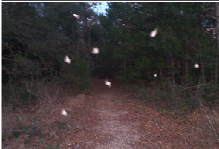
Atmospheric Balls of Energy (ABEs), caught on film!