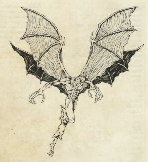
Credit: Encyclopaedia Arcane - Crossbreeding: Flesh and Blood by Wizards of the Coast

A haemovorid attacks by landing on a victim, finding a vulnerable spot and plunging its sharp proboscis into the flesh.