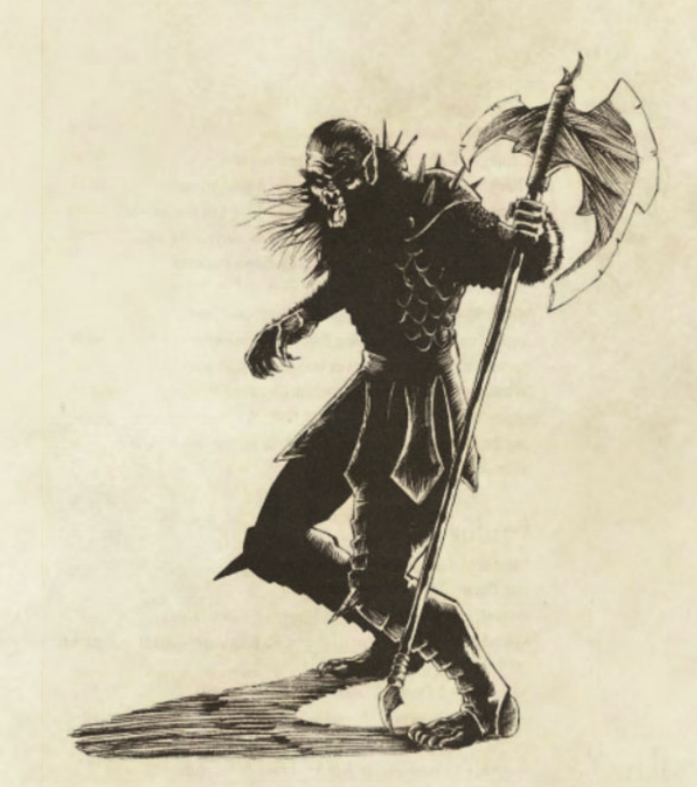
Credit: Encyclopaedia Arcane - Crossbreeding: Flesh and Blood by Wizards of the Coast

Gulor tribes are most often found living by themselves, but occasionally work with orcs. They speak a guttural form of the orc tongue. Despite their bestial appearance, gulors are adept at weapon use and often wear scale mail armor. They enter battle weilding greataxes but often drop their weapons in favor of rending their enemies with teeth and claws, especially once their famed battle rage overcomes their sensibilities.