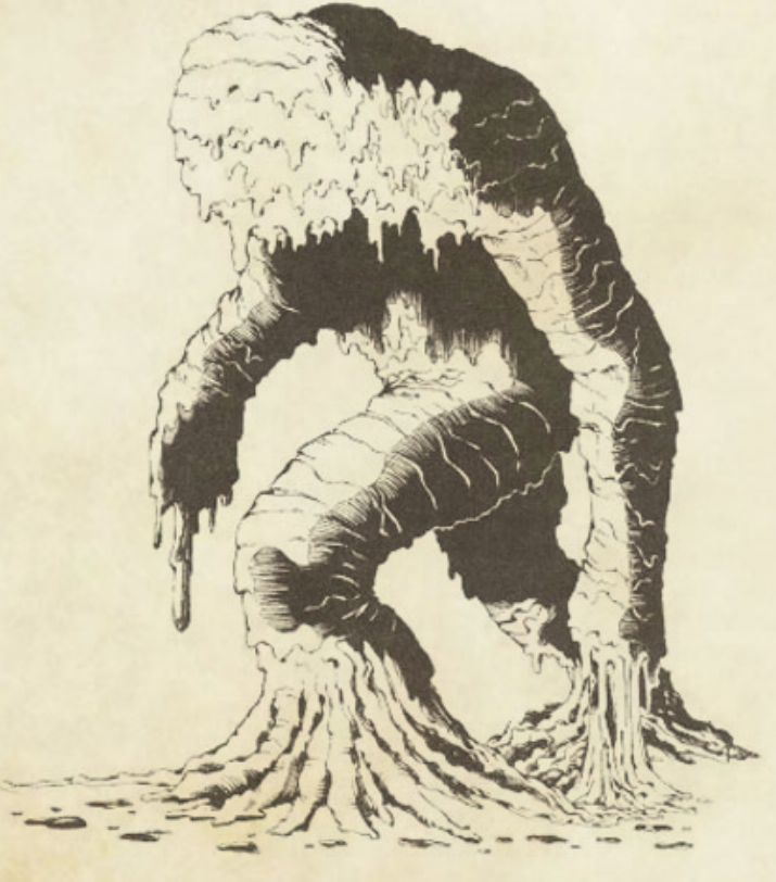
Credit: Encyclopaedia Arcane - Crossbreeding: Flesh and Blood by Wizards of the Coast

Through a mud elemental moves slowly and ponderously, it is a ruthless opponent. It can travel through solid ground or stone as easily as humans walk on earth's surface, but cannot swim. Mud elementals must either walk around a body of water or go through the ground underneath it, as immersion in water dissolves their muddy bodies.