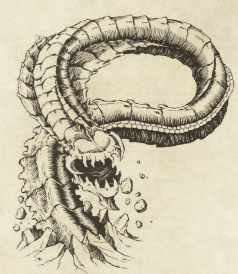
Credit: Encyclopaedia Arcane - Crossbreeding: Flesh and Blood by Wizards of the Coast

The size of the progenitor creatures involved in the hybridisation of a magma worm - specifically of the purple worm - causes additional difficulties to the crossbreeder. This particular fusion is most often performed deep underground, in a specially modified cavern equipped as a laboratory. After all, it is often much easier building a laboratory deep underground where the purple worm is most often found than finding a way to safely (and probably secretly as well) capture and transport such a creature to a laboratory on the surface world. Some crossbreeders even take this one step farther and build their laboratories in air-filled pockets upon the Elemental Plane of Earth. From ther, a fire snake can be beckoned from its home in the Elemental Plane of Fire, and the transmutation ritual can commence.