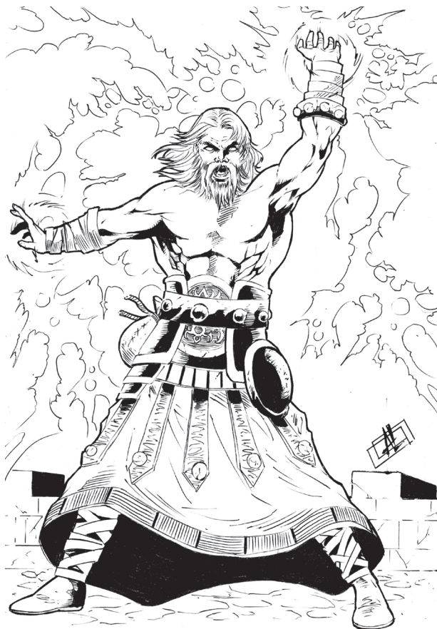
Lightning Blast allows a character to channel electricity through his blast shard

Benefit: Your weapon shard damage increases to 2d6.