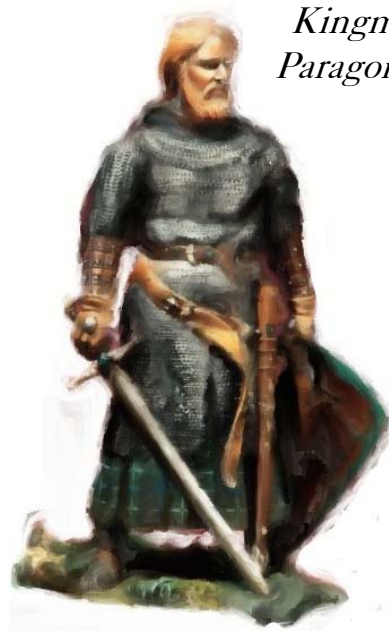
Kingmaker Paragon Path

The world of Terra and, in particular, the region of Cthonia has a variety of unique paragon paths. In this campaign setting, paragon paths provide more of a role in the setting itself along with helping you define your character. They can build upon a story you already created for your character during your heroic adventures or take you upon a new path of exploration. More importantly, they allow you to further step into the world and shape its destiny along with your own.