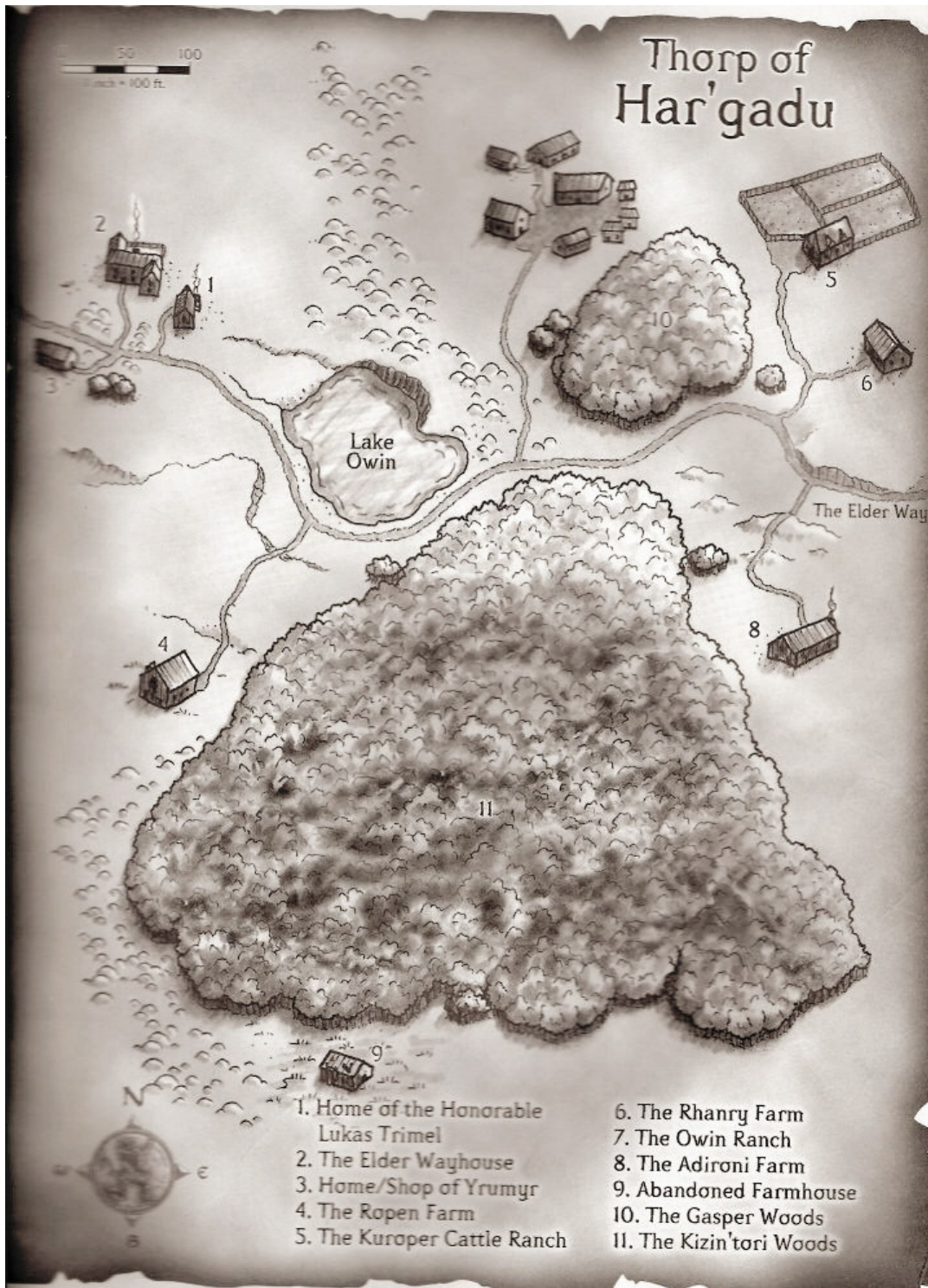
Map from the Pekal Gazetteer