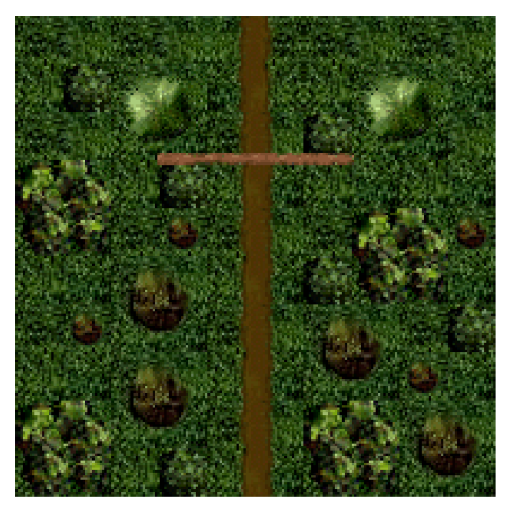
Road is 25' wide and straight. Tree is dropped 30 in front of carriage. Carriage is a 10' x 10' square. Horses are 10'x10' square as well. Carriage is on the left hand side of the road.