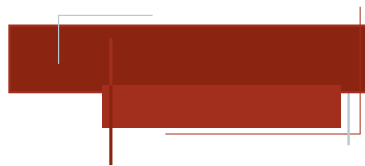
Example 2. Chapter Start Graphics Not actual size