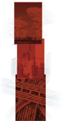
Example 3. Gutter Graphics 20% of actual size