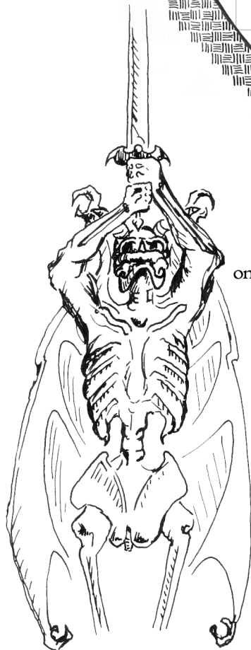
Demon carving on entryway column.