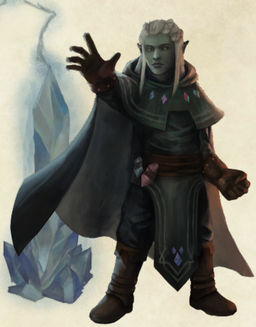
Crystalline Soul sorcerous origin by Hammered Out Homebrew

This damage increases to 3d8 at 6th level and 4d8 at 18th level. You may create a number of crystal conduits equal to your Charisma modifier (minimum of 1) and regain all expended uses upon completing a long rest.